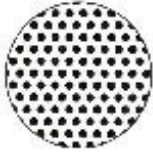
ImageVue & ImageJetVue (1.5-mm holes, 85/35 perforation pattern)