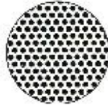
ClassicVue (1.5-mm holes, 50/50 perforation pattern)